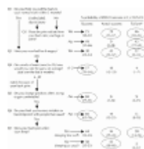
Fig. 3: Clinical algorithm to predict an outcome at 2 years of return to work in good health (RWGH) among workers consulting in primary care settings for back pain. All values shown are percentages. High-probability categories in each group, as were used ...